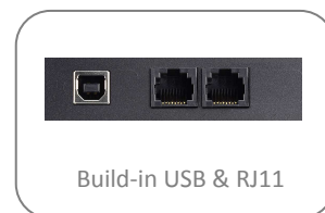
Build-in USB & RJ11